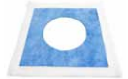
100mm Pipe/Puddle flange