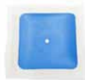
Pipes / Spindles 5mm