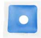
Pipes / Spindles 28mm