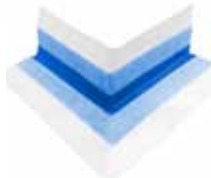
Floor - Wall External junction